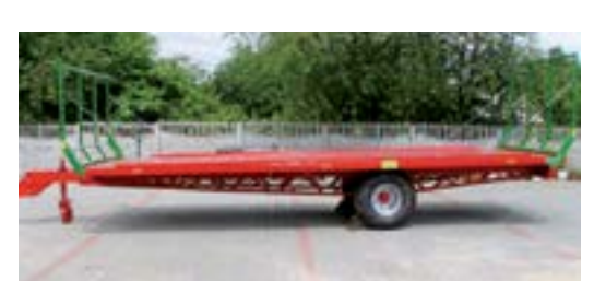
5) 7T low-loading platform for transporting box pallets, height from the ground 88 cm, rigid suspension, open load platform 740 cm x 245 cm/125cm